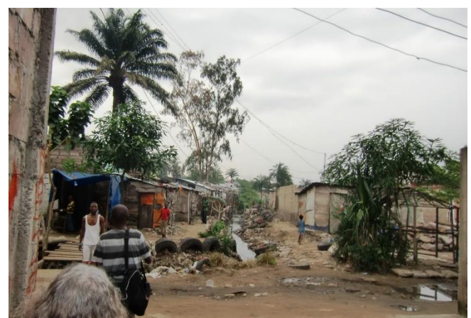
Urban sprawl in Kinshasa, now 13+ million people covering an area the size of LA – without the freeways!

Multistory bamboo housing could be instrumental to counteract the worldwide urban sprawl with its paralyzing transport problems. Both the unemployed people suffer and the rich, sitting in bottlenecks.