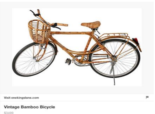
One Kings Lane

The leading theme was - mainstreaming bamboo production, design and marketing - , meaning that the